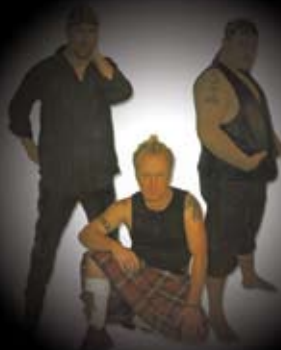
Bzrk Show Band