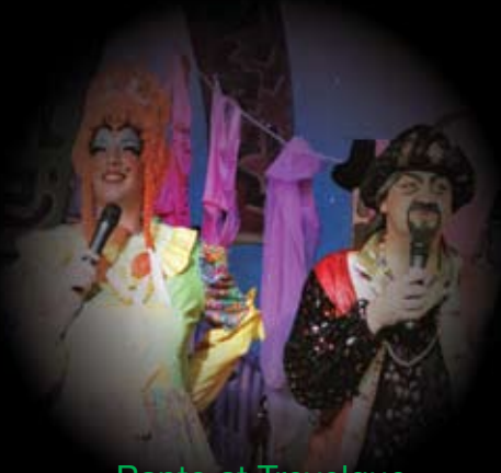
Panto at Trevelgue